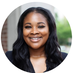
WRBC Newsletter Editor